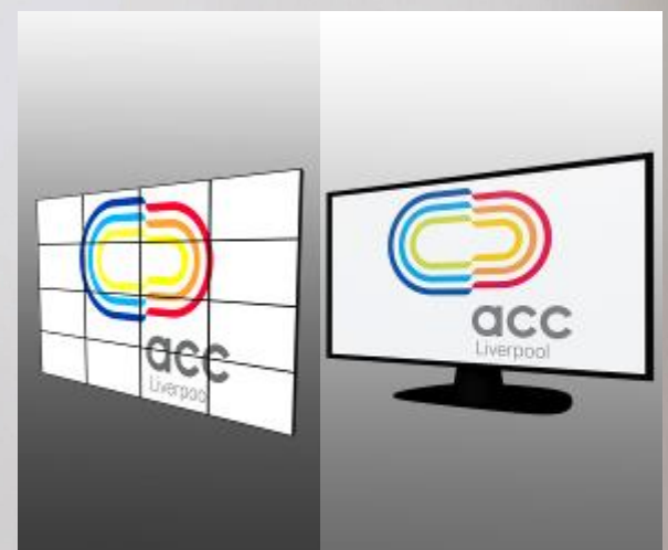
Example of video wall